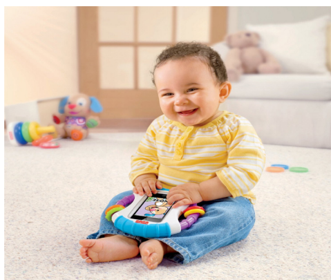
Fig. 3. An iPad placed within a rattle. Note the device is immediately over the boy’s testicles.

Digital dementia also referred to as FOMO (Fear Of Missing Out) is a real concern. A science publication’s review