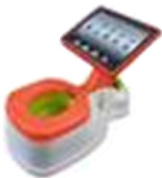
Fig. 4. 2-in-1 iPotty with Activity Seat for iPad.