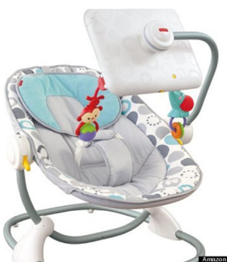
Fig. 5. An iPad for entertaining a baby.

article describes the problem in great depth [45]. An empirical study of the problem was published in 2013 [46].